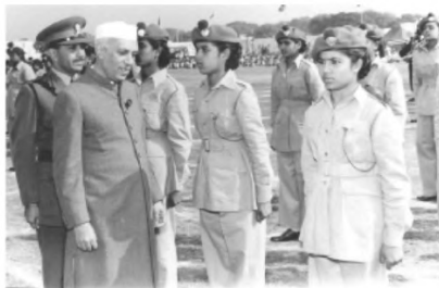
First Prime Minister of India Jawaharlal Nehru reviewing Guard of Honour

In the year 1948 a total of 96 units of Senior Division were raised, comprising variety of units to include one Armoured Corps, three Artillery, five Engineers, two Signals and two Medical – and 83 companies of Infantry. As there was some delay in the establishment of NCC in UP, Madras and Bihar, whose Govts wanted every student joining NCC to be verified by police prior to enrolment, only 20,000 cadets had joined the NCC in the year 1948. The raising of the Junior Division units did not progress well owing to shortage of trained school teachers. The main difficulty was that adequate number of teachers of the desired quality did not come forward to work as NCC officers. There were various administrative reasons attributed to this. Sometimes, colleges and schools were not in a position to spare the teaching staff except during the summer vacation. Thus the NCC which has now 13 lakh cadets on its rolls, had started with 20,000 cadets in 1948.