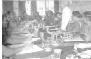
Dr. Hriday Nath Kunzuru addressing Directors of NCC (now called Deputy Director Generals) Conference

Report was sent to the Chief Secretaries and Chief Commissioners of all Provincial Govts (now called State Govts) for their comments. The consent of Provincial Govts were required because they were responsible for the administration of the educational institutions in their respective provinces and thus the success of the Cadet Corps scheme largely depended on their initiative. Replies received from the provinces in Jan 1948, show that they all agreed in principal with the Cadet Corps Scheme submitted by the Kunzuru Committee.