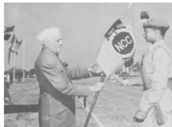
Pandit Jawaharlal Nehru presenting Republic Day banner