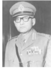
Then Colonel (later Chief of Army Staff) GG Bewoor. First Director (now called Director General) of NCC

Secretariat, with Col (later retired as Chief of Army Staff) Gopal Gurunath Bewoor as first Director of the NCC. He took over as Director of NCC on 31 Mar 1948.